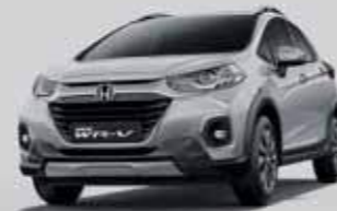
Platinum White Pearl