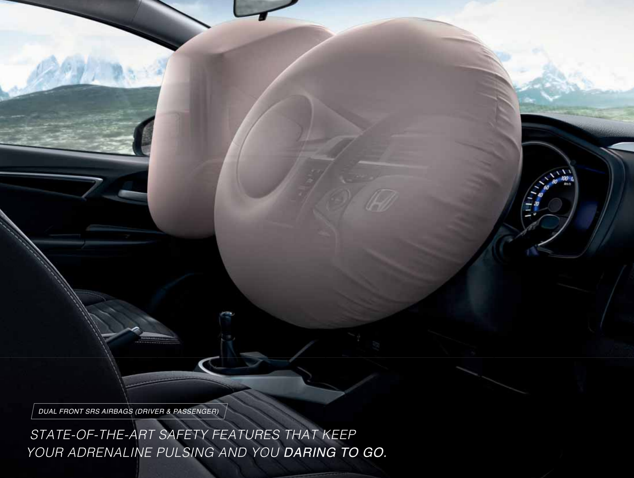
DUAL FRONT SRS AIRBAGS (DRIVER & PASSENGER)

STATE-OF-THE-ART SAFETY FEATURES THAT KEEP YOUR ADRENALINE PULSING AND YOU DARING TO GO.