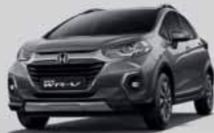
Modern Steel Metallic