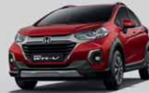
Radiant Red Metallic