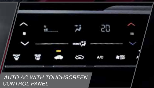
AUTO AC WITH TOUCHSCREEN CONTROL PANEL