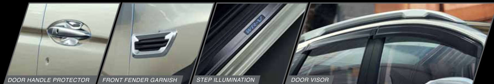
DOOR HANDLE PROTECTOR FRONT FENDER GARNISH STEP ILLUMINATION DOOR VISOR