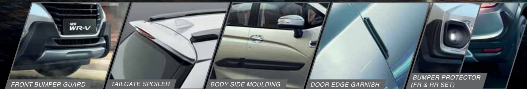
FRONT BUMPER GUARD TAILGATE SPOILER BODY SIDE MOULDING DOOR EDGE GARNISH BUMPER PROTECTOR (FR & RR SET)

ACCESSORIES THAT DRESS FOR THRILL, FLAUNT STYLE, AND GET YOU DARING TO GO