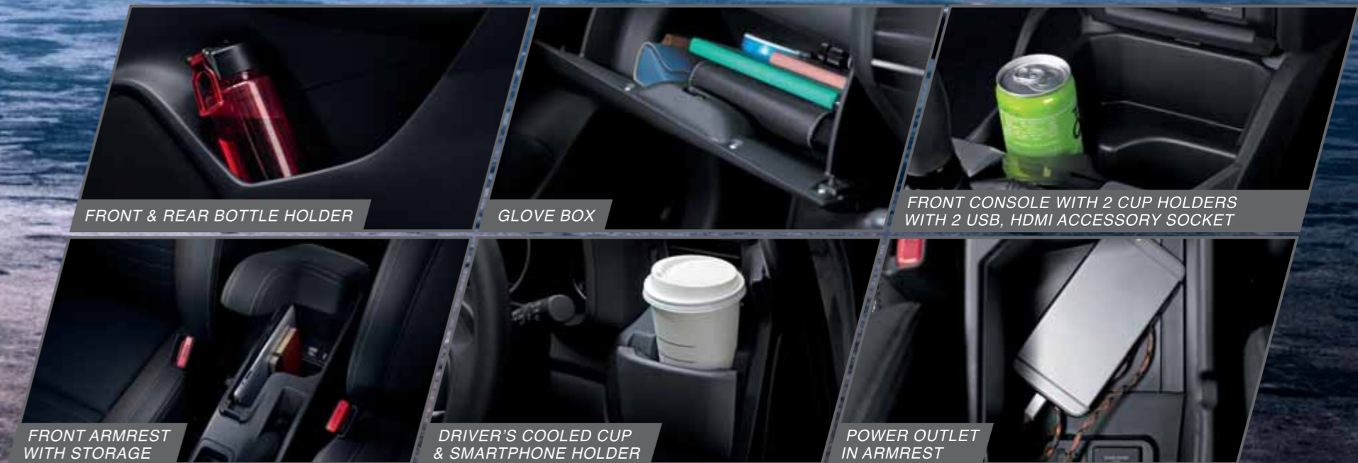
FRONT & REAR BOTTLE HOLDER

CONVENIENT STORAGE SPACE AND ROOM FOR ACTION-PACKED EXCITEMENT THAT'S DARING TO GO