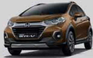
Premium Amber Metallic