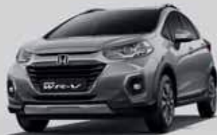
Lunar Silver Metallic