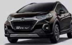
Golden Brown Metallic