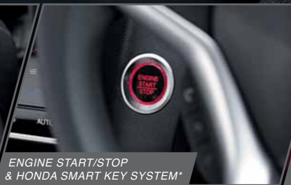
ENGINE START/STOP & HONDA SMART KEY SYSTEM*